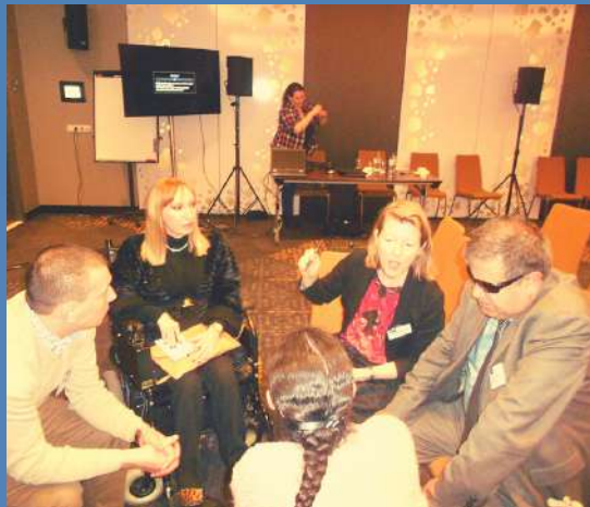
At the EDF meeting, consultations in the working group

Also, she is a member of the Platform of Organizations for Cooperation with United Nations Human Rights Mechanisms, founded by civil society organizations, which have significant experience based on reporting to UN human rights mechanisms.