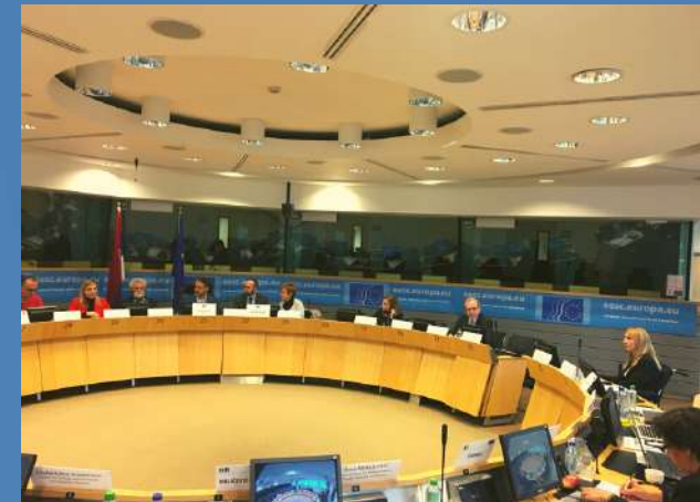
Meeting in European Economic and Social Committee, Brussels