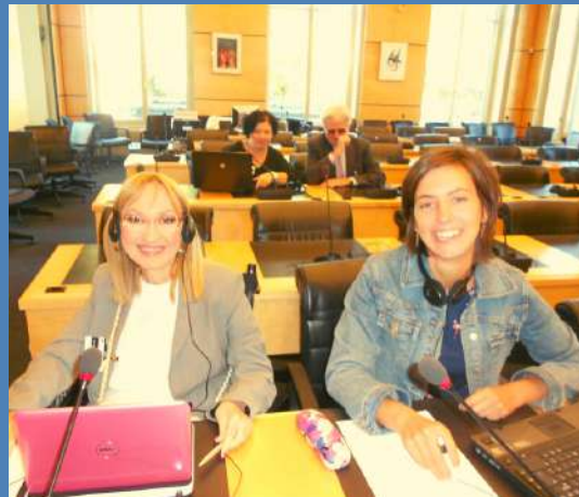
At Palais Wilson in Geneva (CRPD) 2015, during presentation of alternative report